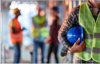
Construction and traffic control