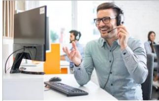
Contact and call centres