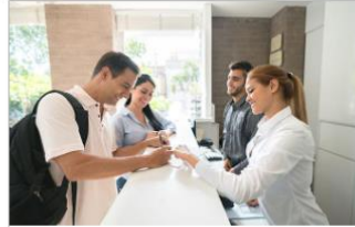
Hospitality and tourism