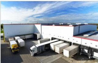
Logistics, warehousing and transport